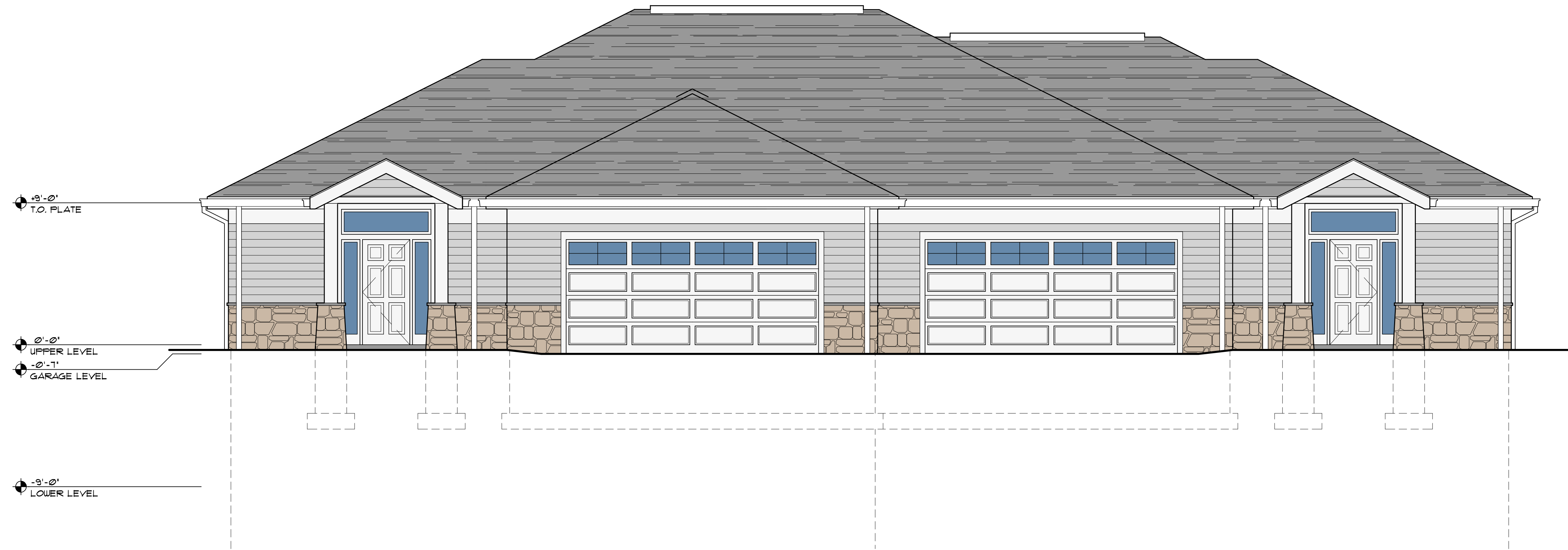
1 WEST ELEVATION 1/4" = 1'-0" FILE: