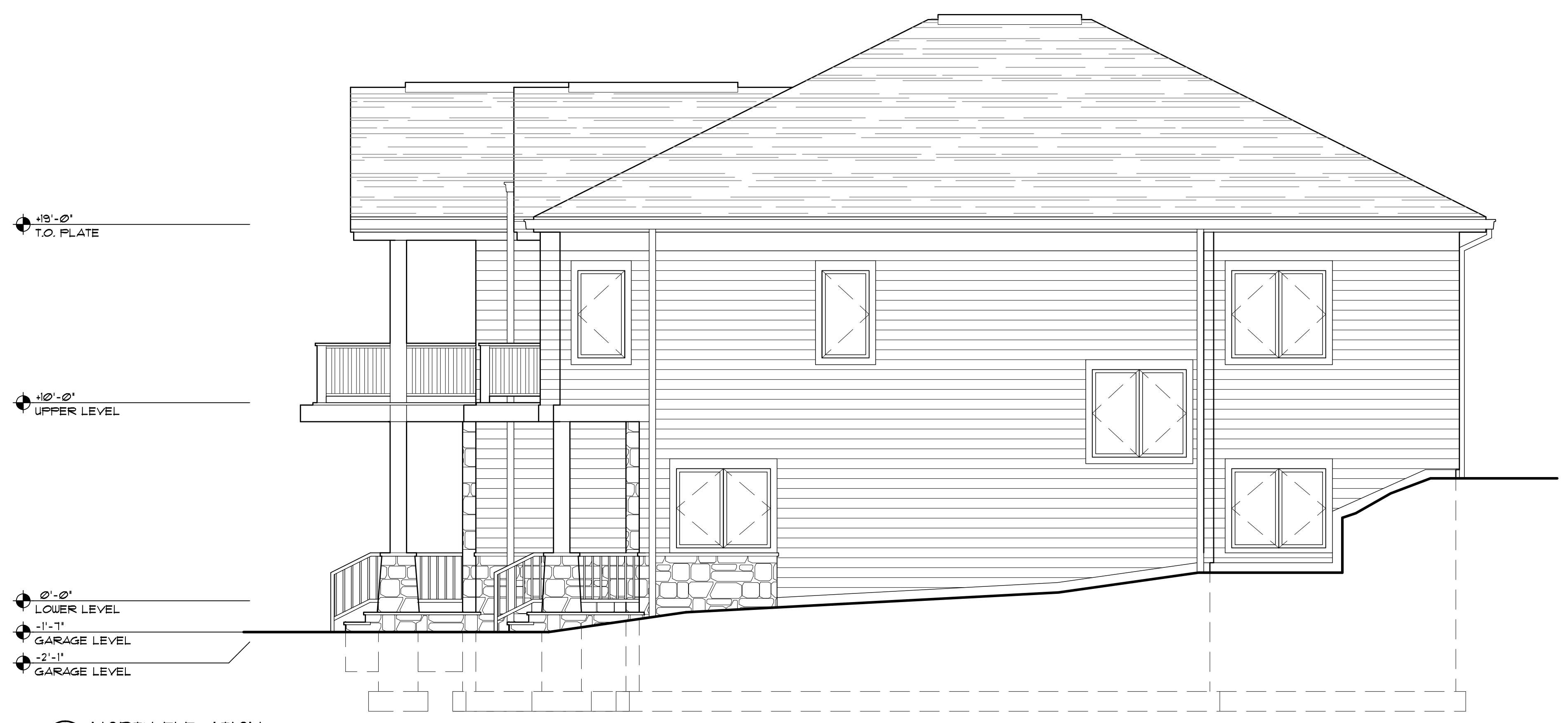
2 NORTH ELEVATION 1/4" = 1'-0" FILE: