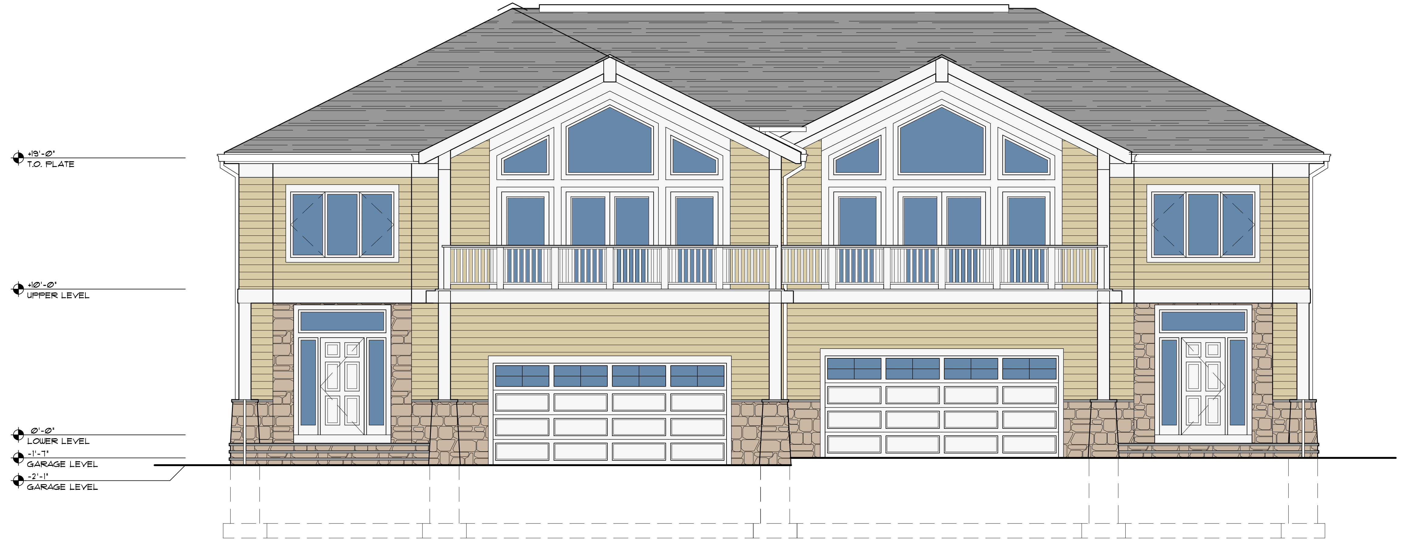
1 EAST ELEVATION 1/4" = 1'-0" FILE: